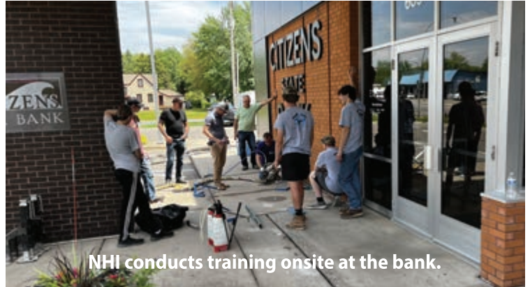
NHI conducts training onsite at the bank.